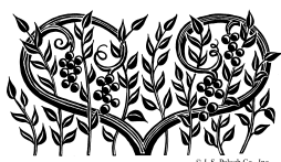
© J. S. Polach Co., Inc.